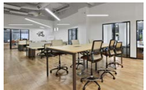
Shared Desks offer a flexible full-time workspace solution, allowing members to choose any open seat in the common area.