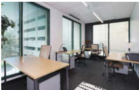
Private Team Offices are fully furnished and lockable with unlimited 24/7 access. They are available for two people or for your whole team.