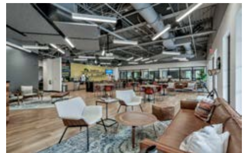
The Café & Lounge/Reception areas serve as a hub of activity and naturally foster the collaborative community. Gather at the Café/Pantry for free coffee, tea or filtered water.